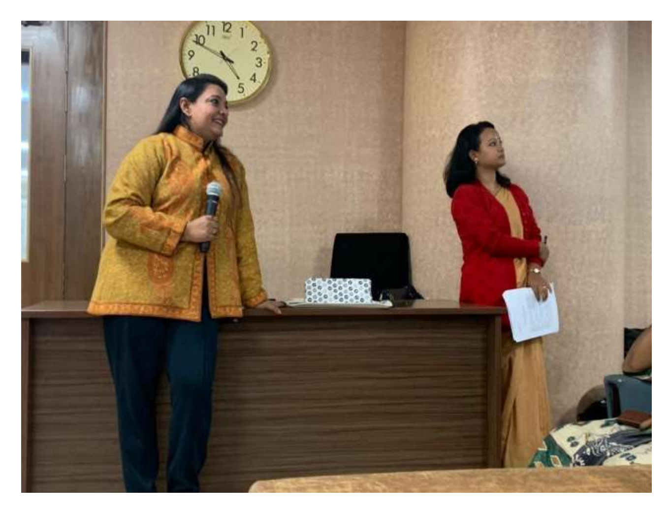
During the interactive sessions with the students